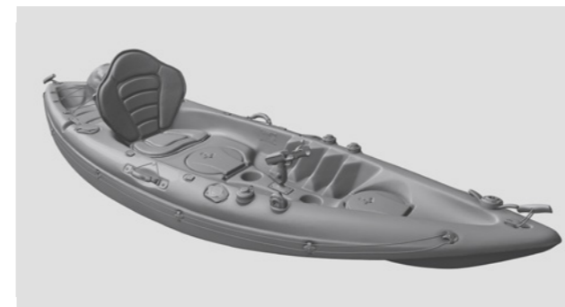
| Turbines, ship propellers, small boats