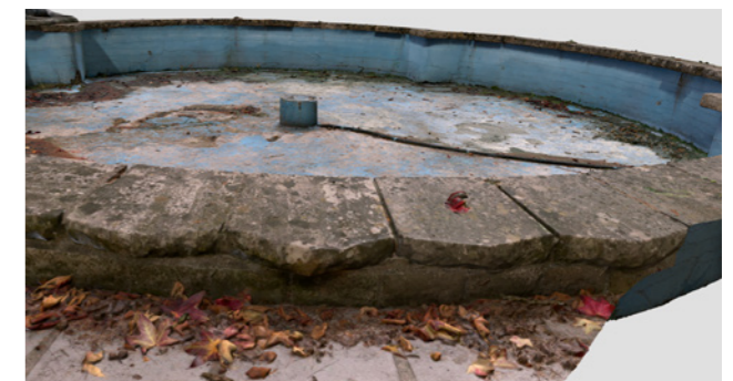
| Crime scenes