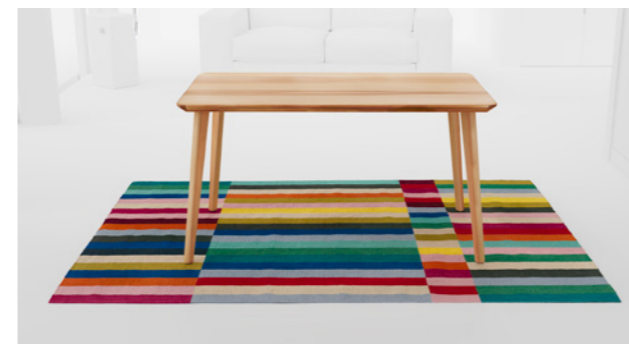
| Furniture and room interiors