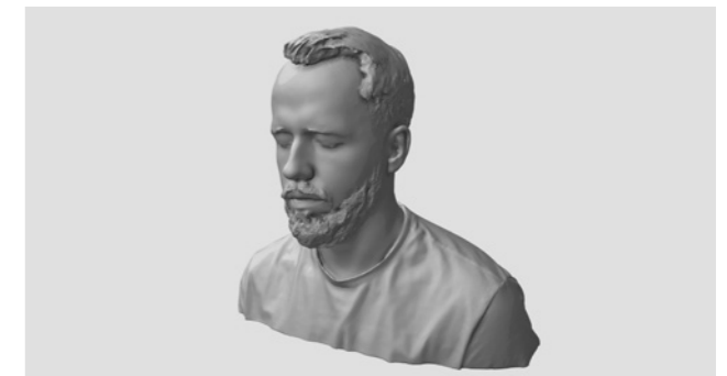
| Statues, and the human body